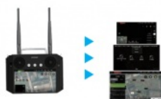
New APP, easy to operate