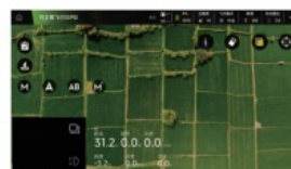
Mapping, route planning