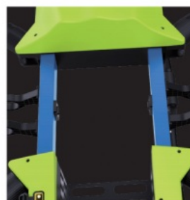
Flight control system