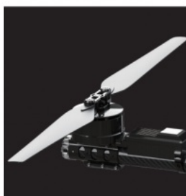
High performance motor