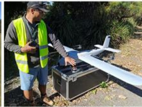
Foreign customers visit our factory and love our craftsmanship