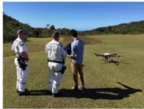
Our products are deeply loved by foreign users