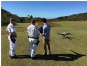
Our products are deeply loved by foreign users