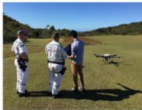
Our products are deeply loved by foreign users